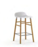
Form bar stool 65 cm wood H: 77 x L: 43 x D: 42,5 x SH: 65 cm