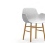
Form armchair wood H: 80 x L: 56 x D: 52 x SH: 44 x AR: 66,5 cm