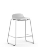
Form bar stool 65 cm stacking steel, chrome H: 77,5 x L: 58,5 x D: 45 x SH: 65 cm