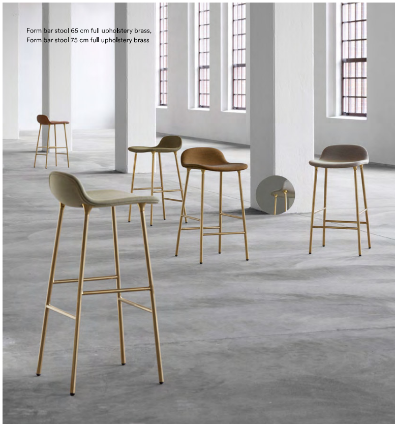
Form bar stool 65 cm full upholstery brass, Form bar stool 75 cm full upholstery brass