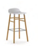
Form bar stool 75 cm wood H: 87 x L: 45 x D: 45 x SH: 75 cm