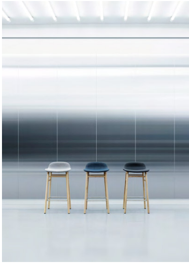
Form bar stool 65 cm full upholstery oak