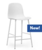
Form bar chair 65 cm steel H: 100 x L: 48 x D: 52 x SH: 65 cm