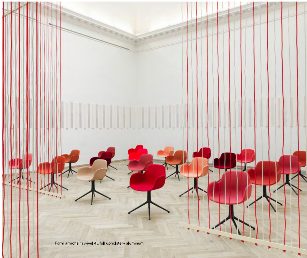
Form armchair swivel 4L full upholstery aluminum

We recommend to check and tighten screws every 3-6 months. Please make sure your choice of glides is suitable for the type of flooring. We recommend to check the glides every 3-6 months. If worn down, please replace.