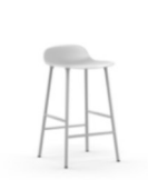
Form bar stool 65 cm steel, chrome, brass H: 77 x L: 42,5 x D: 42,5 x SH: 65 cm