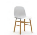
Form chair wood H: 80 x L: 48 x D: 52 x SH: 44 cm