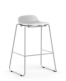
Form bar stool 75 cm stacking steel, chrome H: 77,5 x L: 60,5 x D: 48,5 x SH: 75 cm