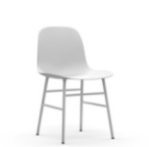
Form chair steel, chrome, brass H: 80 x L: 48 x D: 52 x SH: 44 cm