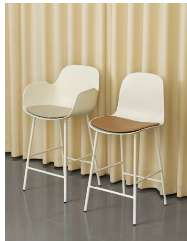
Form bar armchair 65 cm steel with seat cushion, Form bar chair 65 cm steel with seat cushion