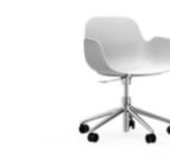
Form armchair swivel 5W gaslift H: 73/86 x L: 72,5 x D: 72,5 x SH: 37/50 x AR: 59/72 cm