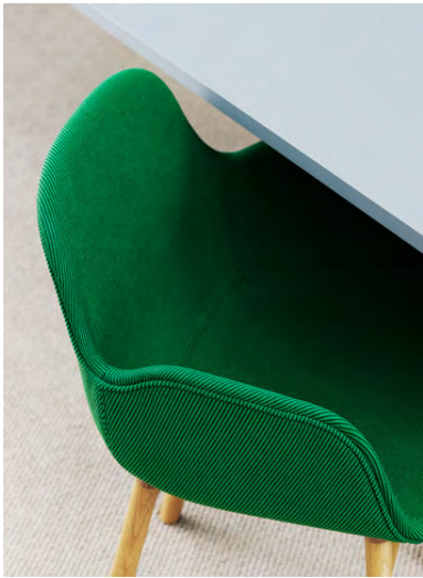
Form armchair full upholstery oak