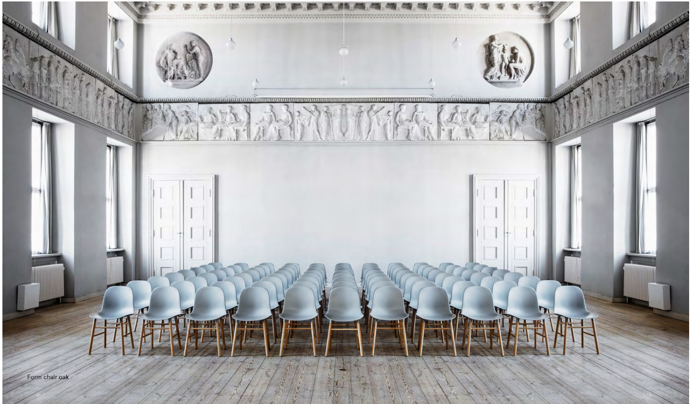
Form chair oak