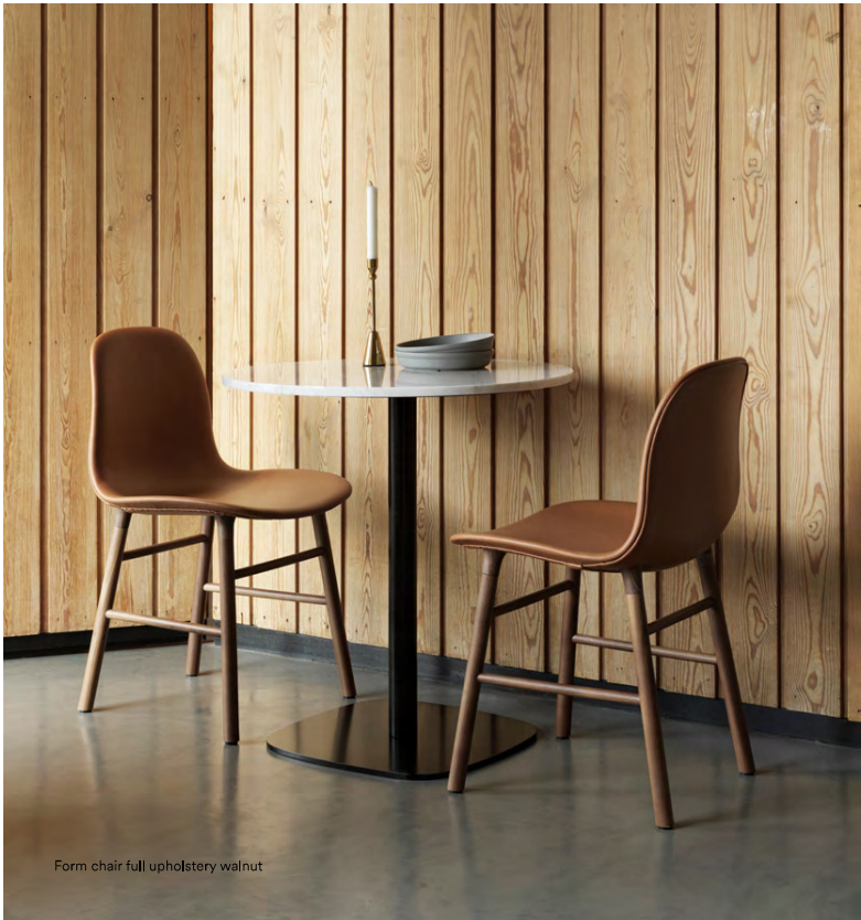
Form chair full upholstery walnut