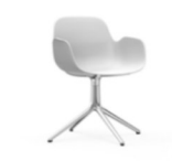
Form armchair swivel 4L H: 80 x L: 70,5 x D: 70,5 x SH: 44 x AR: 66,5 cm