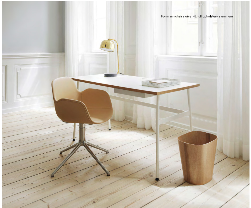
Form armchair swivel 4L full upholstery aluminum

Form tells the story of a design company and a designer with the vision of creating the perfect chair. A tribute to form itself, the uncompromising design combines a strong design idiom with comfortable curves and an innovative industrial technique. The sleek mounting solution developed especially for the Form chair creates a natural integration between seat and base and makes it possible to mount different types of bases in the same openings. While retaining a homogenous and aesthetic design, the Form chair can be customized from more than 100.000 possible combinations of models, colors, textiles and bases, offering a wealth of opportunities for creative expression.