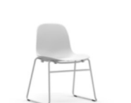
Form chair stacking steel, chrome H: 80 x L: 58,5 x D: 52 x SH: 44 cm