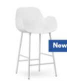
Form bar armchair 65 cm steel H: 100 x L: 56 x D: 54,5 x SH: 65 x AR: 87 cm