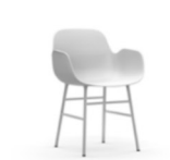
Form armchair steel, chrome, brass H: 80 x L: 56 x D: 52 x SH: 44 x AR: 66,5 cm