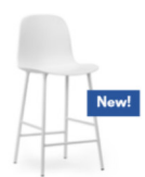
Form bar chair 75 cm steel H: 110 x L: 49 x D: 54,5 x SH: 75 cm