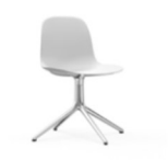
Form chair swivel 4L H: 80 x L: 70,5 x D: 70,5 x SH: 44 cm