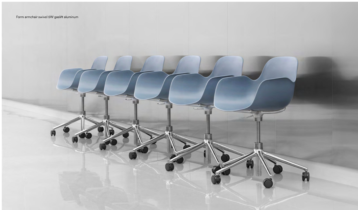
Form armchair swivel 5W gaslift aluminum