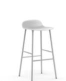
Form bar stool 75 cm steel, chrome, brass H: 87 x L: 43 x D: 43 x SH: 75 cm