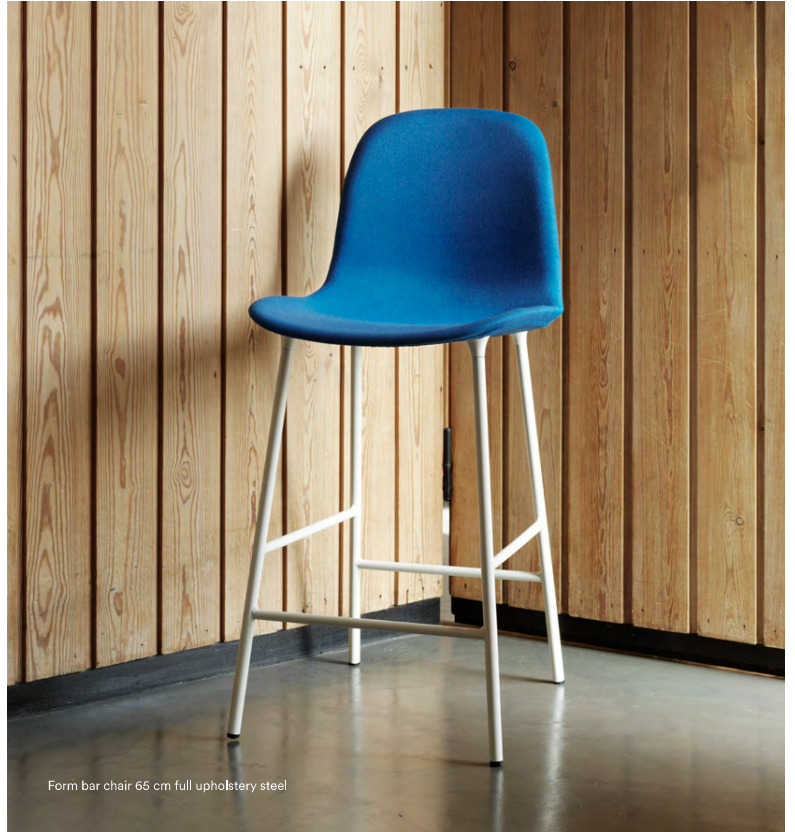
Form bar chair 65 cm full upholstery steel