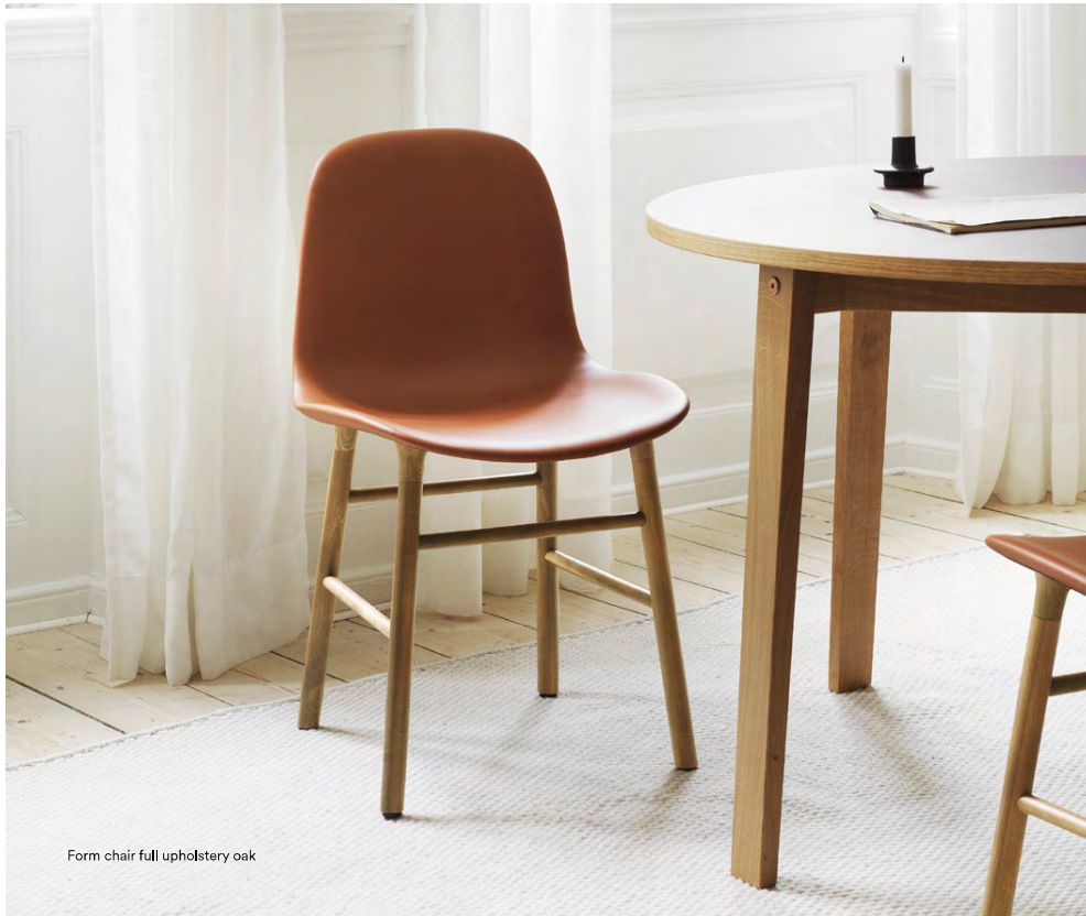
Form chair full upholstery oak