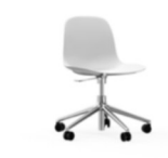
Form chair swivel 5W gaslift H: 73/86 x L: 60 x D: 52 x SH: 37/50 cm